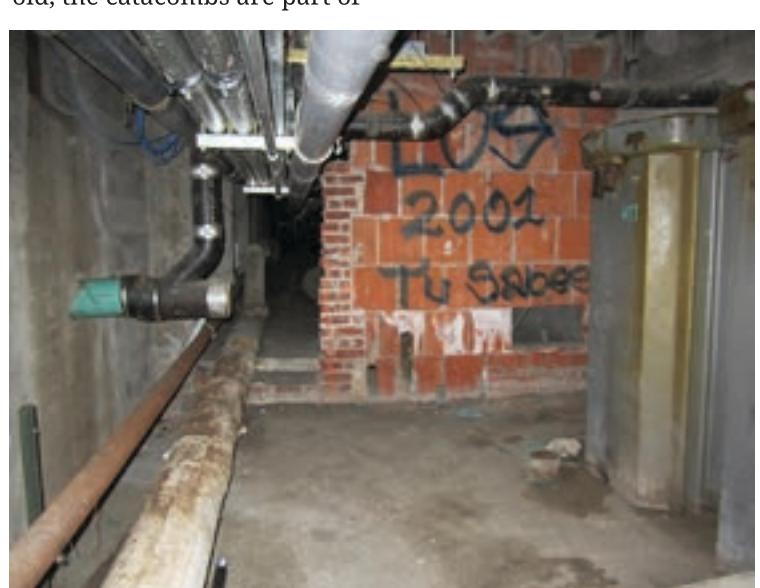
Back end of main tunnel

Once all of the "tourists" had descended to the netherworld, it was obvious even to a layman, that the vast network of tunnels house nothing more than interconnecting pipes and cables that service the college's electrical and plumbing needs. One might think this all a bit anticlimactic, but the sight was impressive nonethe-less. The main tunnel travels back toward the direction of the Chapel and beyond, appearing to go on for an eternity and giving one the impression of a subway sys-