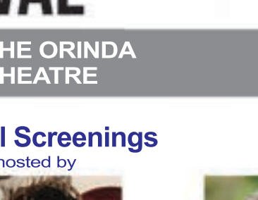
Opening Night Special Screenings hosted by